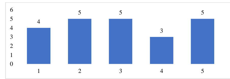
Figure 5. Graph of Student Answer Scores on Question Number 2

From the answers above, it can be seen that students answered directly activated from their initial understanding. Some students gave answers based on their experience in the school environment and the surrounding environment. In answering question number 2, the following distribution of student answer scores is shown in the following Figure 5.