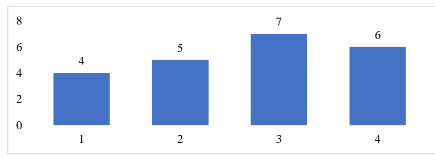
Figure 3. Graph of Student Answer Scores on Question Number 1

In answering question number 1, as seen in the picture above, it shows how students immediately gave answers in accordance with the understanding of Newton's second law that they had received, without looking at the further questions that were explained. In answering question number 1, the distribution of students' answer scores is shown in Figure 3.