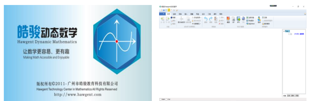
Figure 2. The Pictures of Learning Media Hawgent Dynamic Mathematics Software

In this stage, the researcher designs the learning media or product design and selects the subjects to be studied using the learning model and the learning objectives. Therefore, the researcher designs technology-based learning media using Hawgent Dynamic Mathematics Software in a kite-wide mathematics lesson. for grade VI SD students.