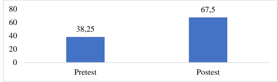
Figure 2. Comparison of Pretest and Posttest Scores.

Based on the results of the t test on the pretest and posttest values in Table 5, the results obtained a significance of 0.000. This significance value is in the area of H_0 rejection so that the working hypothesis is accepted. From these results it can be explained that the activities of optimizing the use of science kits to support scientific learning have a significant effect on increasing the competence of science teachers, where the post-test results are better than the pretest results. The comparison of the pretest and posttest scores in this optimization activity can be shown in Figure 2.