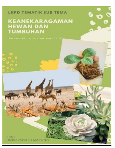
Figure 2. Display of Problem-Based Learning Worksheets

giving assignments according to the lesson, the material taught is thematic theme 7 subtheme 1 "diversity of animals and plants".