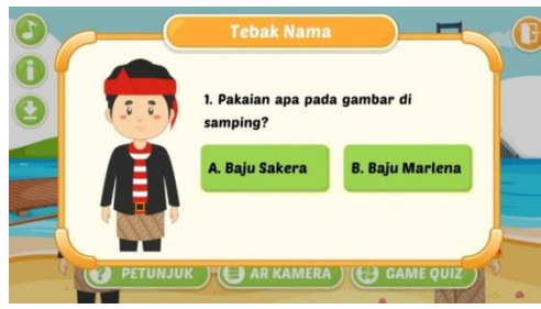
Figure 6. Name Guessing Quiz Game