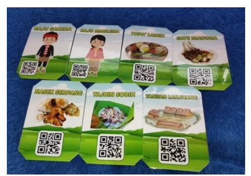
Figure 2. Flashcard Front Design

At this stage, a series of activities were conducted, namely, experts' validation and product trials. The product design is as follows: