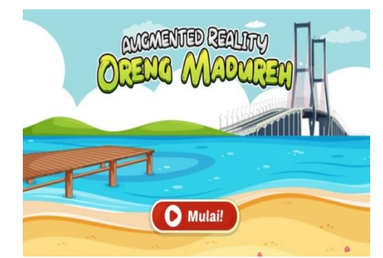
Figure 3. Initial Display