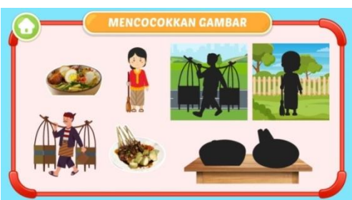
Figure 7. Matching Images Game