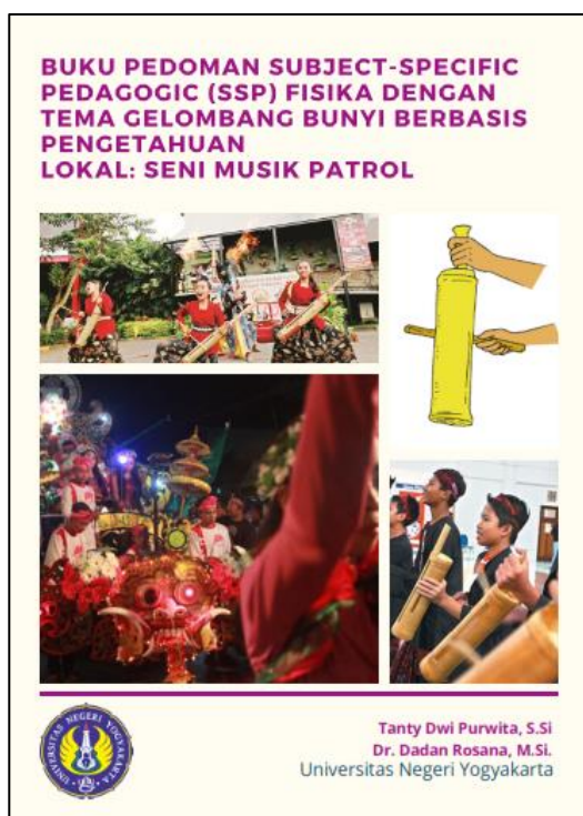
Figure 2. The cover page of physics SSP products