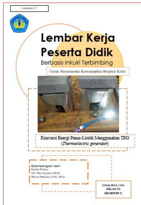
Figure 2. Product's Cover

The product produced from this development research is guided inquiry-based student worksheets on the material of electric thermal energy conversion, which can be seen in Figure 2. The developed SW is made to stimulate students' critical thinking skills in the learning process.