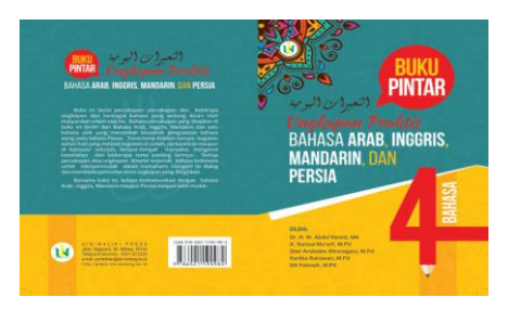
Figure 3. Teaching Material for Human Resources Development Training

The development of Arabic programs is not only for students, but also for Arabic teaching staff (lecturers) and education staff (employees) in the form of training twice a week. The human resource development program is training for educators and education staff in all faculties, guided by Arabic and English lecturers at the Language Development Center (P2B) unit to practice their language skills, the competency for educators is also important to be improved<sup>19</sup>. One of the objectives of the foreign language program is to improve foreign language skills for all educators and education staff so that they are able to help the students optimally<sup>20</sup>. The following figure is material used in the training: