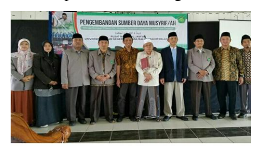
Figure 5. Council of Kyai (Clerics) in Ma'had al-Jami'ah with the Fourth Vice Chancellor

The musyrif and musyrifah are always provided with training and workshops once a semester to improve their competence. As in Figure 5 below: