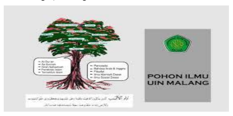
Figure 2. Construction of Scientific Integration

Curriculum development in UIN Maulana Malik Ibrahim Malang is based on integration. Integration between science and religion, curriculum construction is "pohon ilmu" (tree of knowledge"). See figure 3 below: