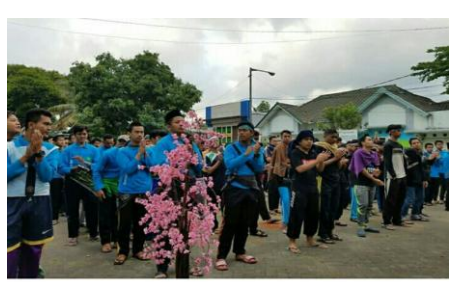
Figure 4. Activity of Shabah al- Lughah

This psychological theory is also supported by the learning theory which said that the diversity of strategies and methods used in a lesson will provide more motivation to students and will encourage the creation of fun and enjoyable learning<sup>26</sup>. Environmental factors have an influence on the language productive abilities of students<sup>27</sup>. Some of these factors can be seen in shabah al-lughah joyful atmosphere which can be seen in Figure 4 below: