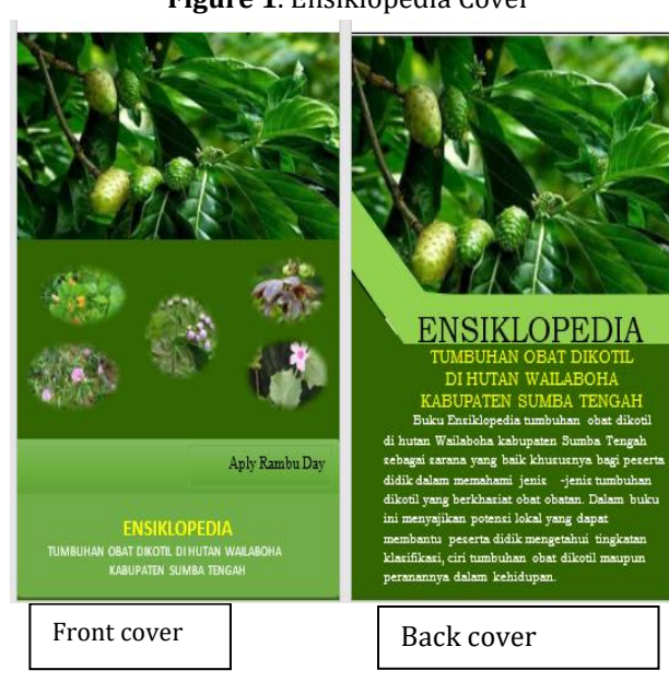
Figure 1. Ensiklopedia Cover

Encyclopedias are reference books used in schools and by general readers to learn more about a topic (García-Pérez et al., 2020);(Susandarini et al., 2021). This encyclopedia book's preparation is tailored to the demands of high school pupils and the 2013 curriculum. The validation test assesses the encyclopedia's content's compatibility with school-age students' needs.