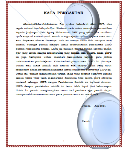
Figure 2. Preface