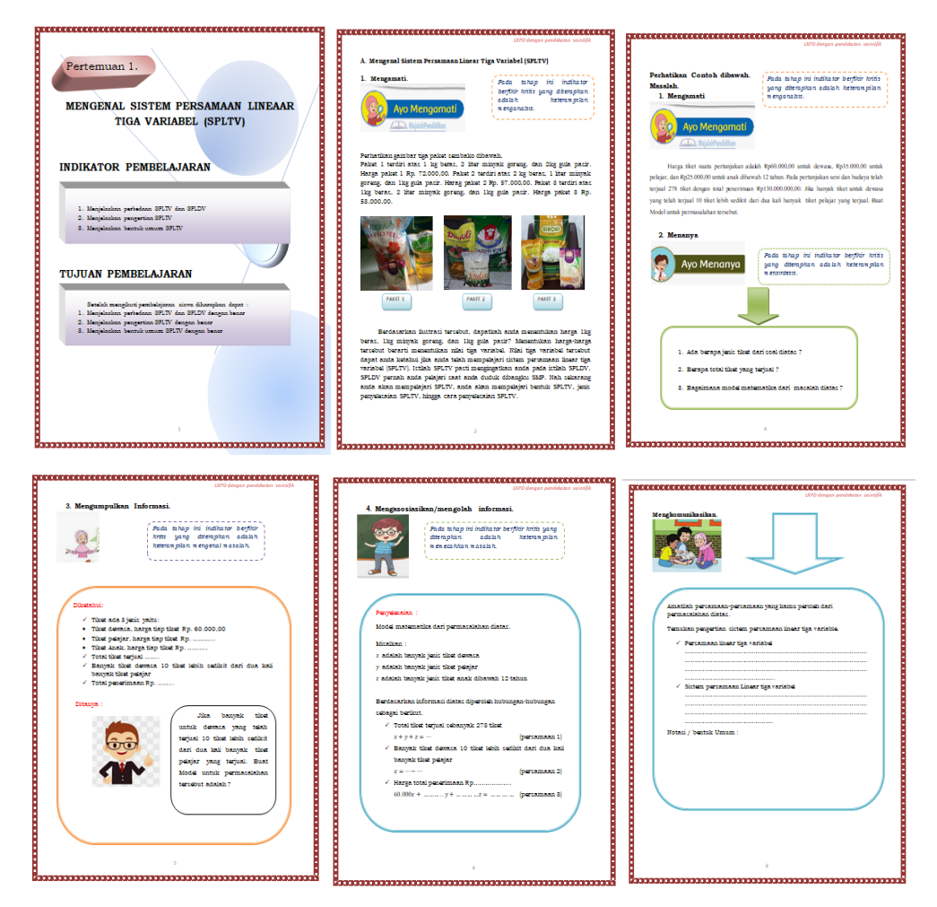
Figure 8. Material Display of a System of Linear Equations with Three Variables (SPLTV)

communicating. This is in accordance with research conducted by Magdalena (2018) entitled developing et al. specialization mathematics learning tools based on a scientific approach for class XI of high school students, which states that the subject matter presented in the LKS is designed according to the of steps of a scientific sequence Scientific approach. approach-based learning begins with observing. Α glimpse of the material can be seen in the following Figure 8.