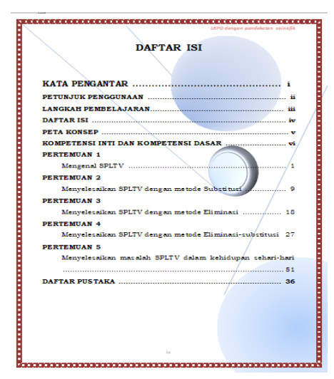
Figure 5. Table of Contents

On the table of contents page, the authors arrange each subchapter of the discussion of a system of linear equations with three variables (SPLTV) material along with the subchapter's page. The table of contents display is shown in Figure 5 below.