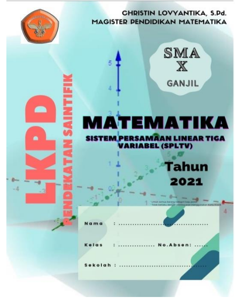
Figure 1. LKPD Cover

In the cover of this LKPD, the authors include the author's name and study program, the logo of the University of Jambi, the LKPD subjects that is Mathematics, SMA/MA, the class used is class X, odd semester. The material studied is a system of linear equations with three variables (SPLTV), for the 2021/2022 academic year, student identity consists of name, class, absentee number, and school origin. Furthermore, the authors also include the writings of LKPD with a scientific approach. LKPD cover designed according to Figure 1 below: