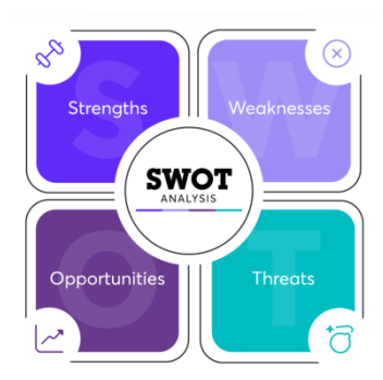
Figure 2. SWOT analysis

An overview of the SWOT analysis of the potential for religious ecotourism at Pesisir Selatan Regency from the results of field research, and interviews is as follows: