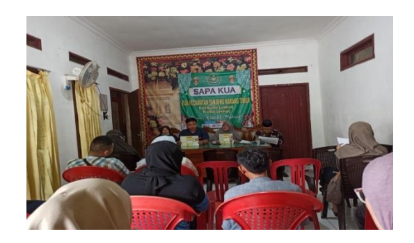
Figure 2. Pre-Marriage Courses Process

accept them with full willingness and calmness in navigating the household, and to be able to adapt, in his household later.