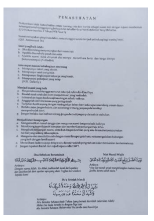
Direktur Jenderal Bimbingan Masyarakat Islam, Peraturan Direktur Jenderal Bimbingan Masyarakat Islam Nomor: DJ.II/542 Tahun 2013.