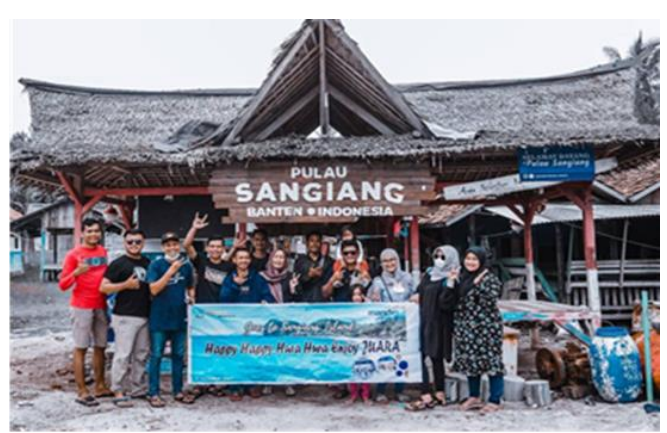
Figure 1 Entrance Gate to Sangiang Island

The tourism sector is currently being boosted to increase again, including in Serang Regency. Serang Regency is an area with attractive tourism potential starting from beaches, islands, waterfalls and others, one of which is Anyer. Who doesn't know Anyer? Anyer is a coastal area famous for its beautiful beaches and buildings with historical value. It was made into a song, "Between Anyer and Jakarta". Anyer is a beach tourism destination that is quite popular in Serang Regency, especially by residents of the capital city of Jakarta because it is only 120 km or approximately 3 hours from Jakarta. Besides its beautiful beaches, Anyer has a charming island, Sangiang Island.