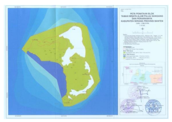
Figure 2 Map of Sangiang Island NTP Block Layout

Sangiang Island is included in the management and supervision of the Ministry of Environment and Forestry of the Republic of Indonesia under the scope of Regional Conservation Section (SKW) Management I Serang. In terms of management, this island is divided into 5 (five) management blocks as stipulated in the Regulation of the Minister of Environment and Forestry of the Republic of Indonesia Number: P.76/Menlhk-Setjen/2015 concerning Management Zones for National Tourism Parks and Management Blocks for Nature Reserves, Wildlife Reserves, Parks Grand Forest and Nature Tourism Park. Sangiang Island Nature Park is divided into 5 (five) management blocks, namely: The protection block covering 275.02 (52.07%), the utilization block covering 196.10 Ha (37.13%) rehabilitation block covering 53.28 Ha (10.09%), the cultural and historical block of 3 Ha (0.57%) and particular block of 0.75 Ha (0.14%).