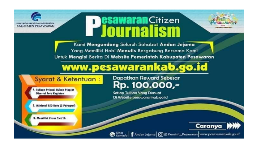
Figure 1. E-flyer for Online News Writing Competition