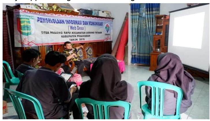
Figure 2. Visit Activities of the Pesawaran District Communication and Informatics Office

that is carried out at the Pesawaran District Communication and Informatics Service Office. This activity is also intended to motivate village website operators to manage village websites, villagers to contribute to providing village website content, and village government officials to understand the importance of village websites for village development, to fully support village website management.