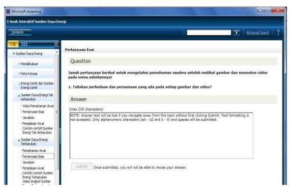
Figure 2. Product 1 of Interactive E-book