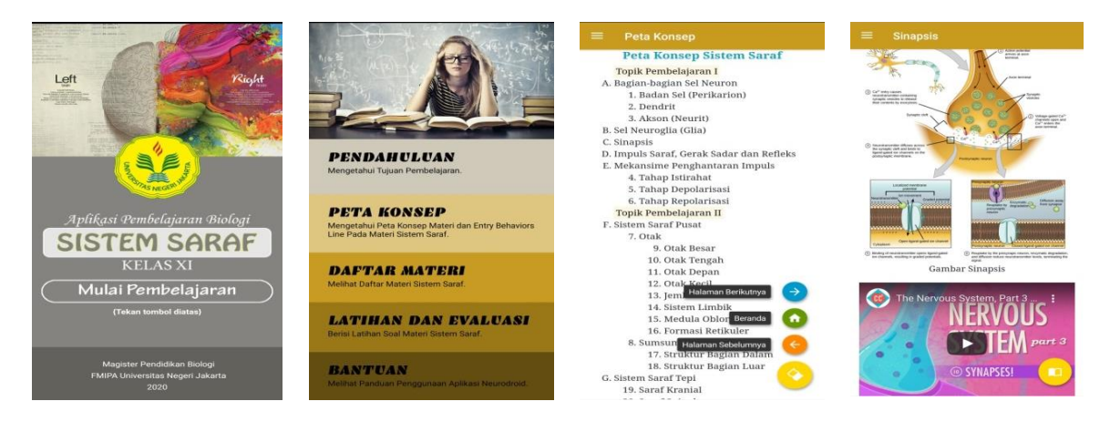
Figure 2. Product Guided Discovery-Based Neurodroid Learning Media of Critical Thinking Skills

correlated with the post-test, so the ANOVA test is needed to determine whether the pretest affects the post-test. Without the pretest value, there is an effect of using guided discovery and conventional Neurodroid media on the post-test scores of critical thinking skills, which means that the post-test scores obtained by students are correct because of the influence of the learning model applied, not because of the experience of students or because they have studied system material nerves before.