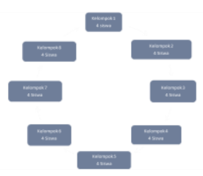
Figure 1. The first pattern of using the two stay two stray learning strategy

Students at this stage discuss the material that has been shared. Then group members are tasked with solving problems in the form of answering questions. The answers to the questions become points that are shared with "two guests" from the other group. The discussion lasted for 20 minutes. After discussion, each group divides tasks between those who are "guests" and those who are members who "stay in their places" as shown in Figure 2.